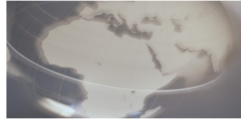
2011 Geography Bowl Champions!!!

making arrangements to carry the program live on Mediacom. Prizes were